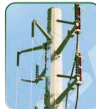
220kV Double Circuit Cable Termination Pole MSETCL (Maharashtra State Electricity Transmission Company Ltd.), Mumbai