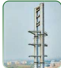
220kV Multi Circuit Tension/ Dead End Dual Pole MSETCL (Maharashtra State Electricity Transmission Company Ltd.), Mumbai