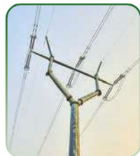
400kV S/C "Tension/Dead End" Y-Pole PGCIL (Power Grid Corporation of India Ltd.), Lucknow